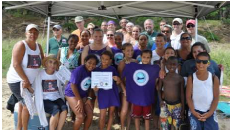
Mashpee youth, community members and team coordinators celebrate completion of the Native Youth in Science - Preserving Our Homelands summer science camp