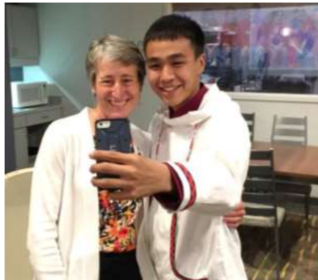
Secretary Jewell and Secretary Kerry with Arctic Youth Ambassadors at the welcome reception for the Global Leadership in the Arctic: Cooperation, Innovation, Engagement, and Resilience (GLACIER) Conference, at the Anchorage Museum in Anchorage, Alaska, on August 30, 2015.