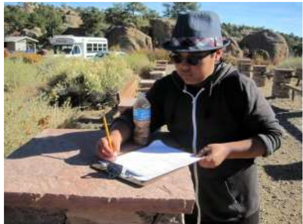
A student participates in BLM's 5 th day event in Colorado

In Colorado's rural San Luis Valley, many schools operate on a 4-day school week to cut costs. Two teachers from Bill Metz Elementary School in Monte Vista volunteered their time to fill that "fifth day" with outdoor science learning. The teachers first attended the "Teaching Environmental Science Naturally" workshop sponsored by Colorado Parks and Wildlife. After the workshop, the teachers took 15 students on Friday field trips around the San Luis Valley, including Penitente Canyon Recreation Area, a BLM Hands on the Land site near La Garita. Students hiked the canyon trails, identified local native trees and shrubs, and sharpened their skills in observation, reading, and analysis.