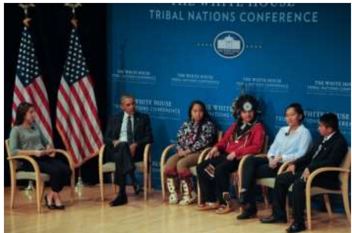
The 2015 White House Tribal Nations Conference

The DOI participates in the annual White House Tribal Nations Conference. The President and members of the Cabinet meet annually with the tribal leaders to discuss ways the Administration can continue to make progress on improving the government-to-government relationship. For the 2015 conference, 24 youth delegates were also asked to participate to share their unique perspective.