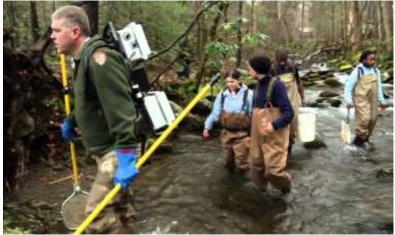
A NPS park ranger works with students at the Great Smoky Mountains National Park in Tennessee

The NPS Academy is an innovative program designed to introduce diverse students to careers with the NPS and other federal land management agencies. The three-phase program begins with a week-long spring break immersion trip to a national park, the second phase is a summer internship with the NPS, and in the third phase, students serve as ambassadors for the program.