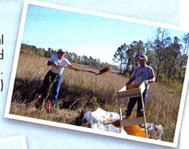
Archaeological survey of proposed housing sites.