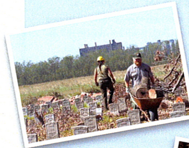
Debris removal from Chalmette National Cemetery.