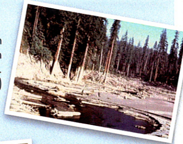
Stream & riparian damage from Mt. St. Helen's eruption.