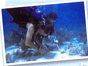
Coral reef restoration (FWS)