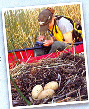
Biological Survey of swan nesting sites. (Yukon Flats NWR, FWS)