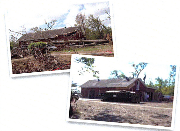
Historic carriage house damaged by Hurricane Katrina before and after stabilization, Chalmette, LA.