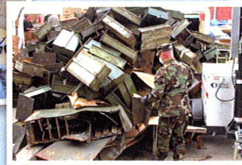
Assessment & Repair of Damaged Records following Hurricane Katrina