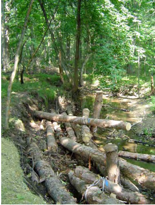
Lancaster Brook Stream Restoration

Additional settlement funds were used for a stream restoration project along one-third of a mile of Lancaster Brook, a coldwater trout stream located in the northern portion of the Oneida Reservation. The stream possesses relatively good water quality, but exhibits highly variable flows and water levels and degraded instream habitat that has diminished the trout population from its historic levels. Through the strategic placement of logs and other large woody debris anchored in the streambed and along the shoreline, this project will improve habitat for native Brook trout and provide food and cover for a variety of other aquatic animals. Natural rain and snowmelt will continue to sculpt the streambed through scouring, and the formation of pools used by the trout. The restoration of Brook trout habitat will in turn improve fishing opportunities for Oneida Tribal members and support their cultural use of natural resources.