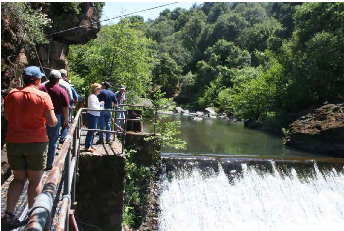
Wildcat Dam to be removed in project to restore fish passage for Chinook salmon and steelhead on the North Fork of Battle Creek

Restoration of natural resources injured at the Iron Mountain Mine involves a network of cooperators that goes far beyond the trustee agencies, and dovetails with ongoing conservation and recreation planning in the area, most notably the wide-ranging Cal-Fed partnership. Three DOI bureaus (Bureau of Land Management, Bureau of Reclamation, and the U.S. Fish and Wildlife Service) are teaming with state trustees, NOAA, the Packard Foundation, the Pacific Gas and Electric Company, and numerous non-governmental organizations to restore 42 miles of anadromous fish habitat in Battle Creek that is important for Chinook salmon and steelhead. The restoration effort entails removing five diversion dams, improving fish passage structures at three other dams, and greatly increasing instream flows, while at the same time maintaining integrity of the hydroelectric power production system. In addition, the trustees are partnering with The Nature Conservancy and Cal-Fed to acquire conservation easements to protect riparian habitat and water quality in the Battle Creek drainage. To compensate for lost recreational uses in this area with increasing recreation demands on public lands, restoration efforts also include several miles of new trail development in partnership with local governments and the McConnell Foundation and the recent BLM acquisition and opening up 900 acres of land from the potentially responsible party.