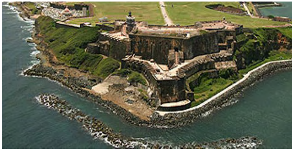
Fort El Morro at the tip of San Juan Peninsula. A Berman Restoration Project now being designed includes an extension of the existing coastal Promenade (on the right side of the photo) around the fort and an overlook at the Water Battery (foreground center)

On Earth Day, April 22, 2007, representatives of the National Park Service, NOAA, and the Commonwealth of Puerto Rico held a kickoff celebration at San Juan National Historic Site to recognize the issuance of the Berman Restoration Plan and announcement of restoration projects. These projects address three types of injuries caused by the oil spill and grounding: reef injuries, lost recreational beach use, and lost visitor use of the national historic site. The restoration projects being implemented include seagrass restoration, modular reef construction, acquisition and protection of a 270-acre parcel of shorefront property in Puerto Rico's valuable and environmentally sensitive Northeast Ecological Corridor, and several restoration projects at the San Juan NHS, including of the extension of the coastal promenade around historic fort El Morro.