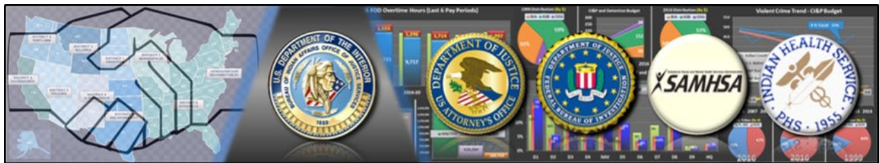
Design with US map in background and outline of clasped hands in a handshake pattern (left), IA Office of Justice Services seal (center), and seals of the US Attorney's Office, Federal Bureau of Investigation, Substance Abuse and Mental Health Services Administration, and Indian Health Service (right).

BIA is the Federal entity most directly responsible for maintaining law and order throughout Indian Country. This funding supports the Office of Justice Services' national leadership team and a number of administrative or support services to manage the activity effectively for Tribes. The team collaborates with other Federal partners, and develops and disseminates standards, policies, and procedures for IA implementation of the law enforcement, corrections, emergency management, land mobile radio, Tribal court, and justice training programs.