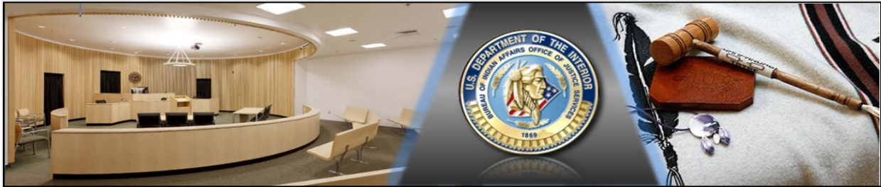
Tribal courtroom with wooden furniture (left), IA Office of Justice Services seal (center) and a wooden gavel set with Native design beside a decorative feather on a blanket (right).

The 2013 VAWA reauthorization included special domestic violence criminal jurisdiction provisions affecting Indian populations on reservations which has had a significant impact on Tribal justice systems, which were maintained and expanded in the 2022 VAWA reauthorization. To ensure compliance with provisions contained in VAWA, IA conducts training for direct service program staff in the areas of law enforcement, social services, victim services, and courts, as well as provides additional technical assistance and training to Tribes operating these programs under Pub.L. 93-638 contracts and compacts, and assists Tribes in updating their codes to reflect provisions in the VAWA Reauthorization as they “opt in.”