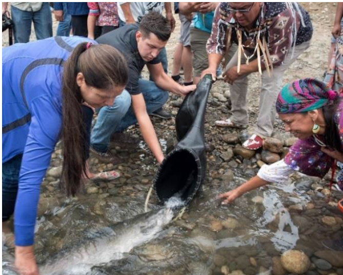
Upper Columbia United Tribes release salmon into Tribal waters.

Upper Columbia United Tribes (UCUT) - The UCUT is comprised of the Coeur d'Alene Tribe, Confederated Tribes of the Colville Reservation, Kalispel Indian Community of the Kalispel Reservation, Kootenai Tribe of Idaho, and the Spokane Tribe of the Spokane Reservation. The UCUT continues its mission to serve its member Tribes' needs and interests by coordinating and uniting fish and wildlife mitigation and restoration work, and developing and participating in efficient local, regional, national, and international partnerships and cooperative relationships that result in direct on-the-ground implementation of efficient and cost-effective projects. The UCUT perform essential government functions to facilitate Federal trust responsibilities concerning the use, protection, and restoration of public resources, with significant benefits provided to regional economies across the Northwest.