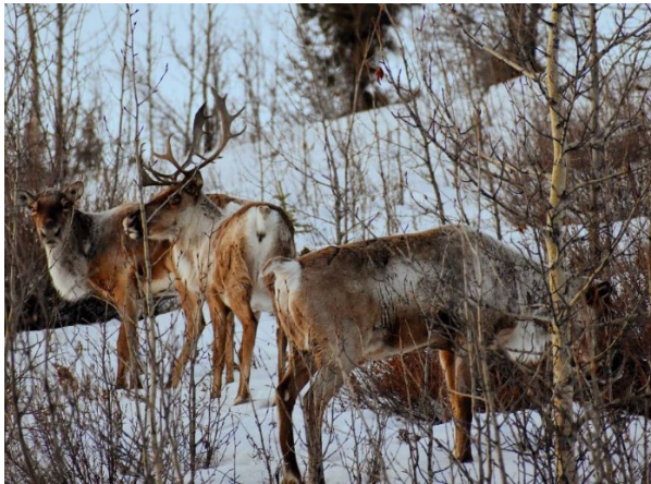
Nelchina Caribou as they migrate through the Ahtna Traditional Territory

Alaska Native Subsistence Program - The Alaska Subsistence program funding supports subsistence hunting, fishing, and gathering plus use of all wild resources (birds, mammals, fish, and plants) from the tundra, forests, streams, rivers, lakes, seashore, and ocean environments of Alaska. Subsistence practices are closely bound to the lifestyle of Alaska Natives, who have long relied upon the land to not only provide physical sustenance, but also to continue rich and diverse cultural traditions. Funds will support and expand projects in targeted areas across Alaska that involve Tribal cooperative management of fish and wildlife, to improve Tribal access to subsistence resources, and to also support IA's role in the Federal Subsistence Management Program in implementing Title VIII of the Alaska National Interest Land Conservation Act (ANILCA).