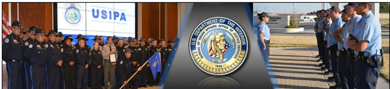
Officers standing together in a ceremony (left), IA Office of Justice Services seal (center), and officers standing at attention outside (right).

The Indian Police Academy (IPA) is located at the Department of Homeland Security Federal Law Enforcement Training Center at Artesia, New Mexico and provides basic police, criminal investigation, telecommunications, and detention training programs at no cost to Tribal or Federal personnel serving the critical public safety needs of Indian Country. The Academy offers a wide range of collaborative training opportunities at the Federal Law Enforcement Training Center (FLETC)- Artesia (NM) and Glynco (GA) Centers for instructor-led and e-FLETC courses and on-site training in specialized courses.