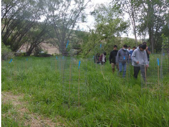
Nez Perce youth planting willow stands to recover beaver populations.

Native American Fish & Wildlife Society - For more than 35 years, the Native American Fish & Wildlife Society (NAFWS), a non-profit, has addressed needs of its 227 member Tribes directly, through conferences, training, and youth education; and indirectly through ongoing support of, and providing venues for government consultations, discussions, and by participating with innovative projects and initiatives in Indian Country. Through its years of assisting Tribal efforts to build capacity and services, the NAFWS enriches Tribes through its mission: assisting Native American and Alaska Native Tribes with conserving, protecting, and enhancing their fish, wildlife, habitat, and cultural resources.