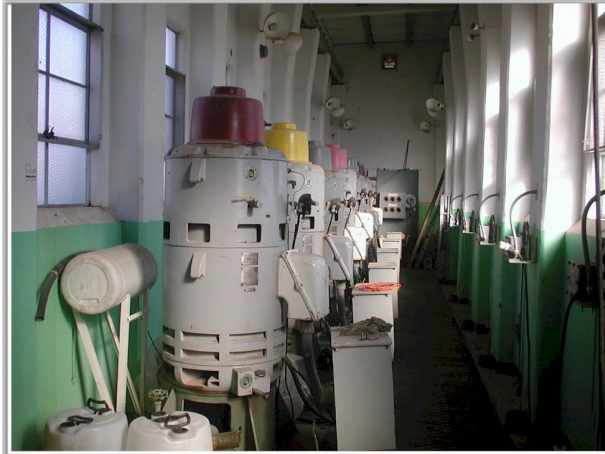
PUMPS INSIDE BANNOCK PUMPING PLANT

Current: $ 0 Projected: $ 0 Net Change: +/- $ 0