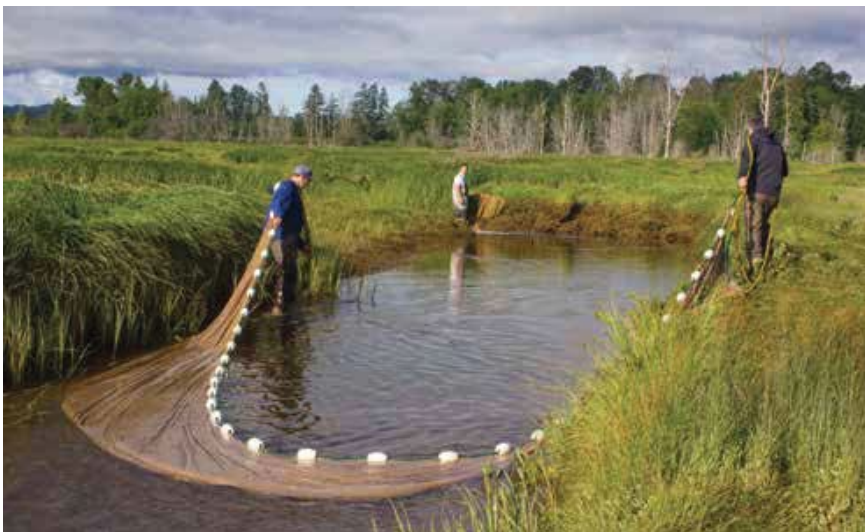
The Skokomish Tribe's fisheries staff seines the restored estuary to determine which fish species are using the side channel while migrating to and from Hood Canal.

NWIFC Wildlife Program - The NWIFC wildlife program provides coordination and support services to its member Tribes on a variety of wildlife management issues and projects.