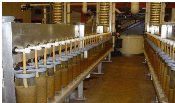
Lac du Flambeau Walleye hatching jars at the William J. Poupart, Sr. Tribal Fish Hatchery.

Tribal hatcheries continue to play a vital role in supporting Tribal fisheries. Hatchery-produced salmon now contribute the majority of salmon harvested in all Washington fisheries, both treaty and non-treaty. Therefore, Tribal hatcheries are a major contributor to the economic value of Washington's commercial and recreational salmon fisheries. In several cases, the Tribal hatcheries are providing the only harvestable salmon and steelhead for the Tribe. For the Boldt Case area Tribes, these hatcheries are an essential component of the Tribes' economies. The production from Tribal hatcheries is also harvested by non-Tribal commercial and recreational fishermen. In the Great Lakes Region and throughout the rest of the country, recreational opportunities created by the stocking of trout, walleye, and other species provide for Tribal subsistence while also attracting sport fishermen to Indian reservations and assisting in the development of reservation economies.