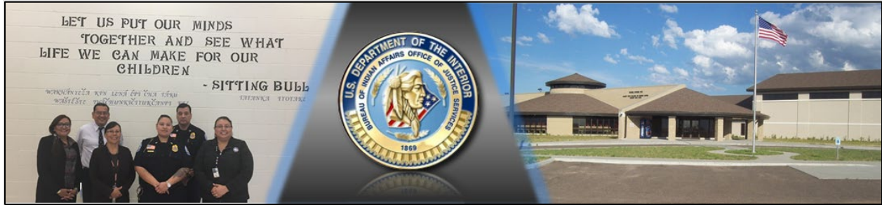
Officers and others standing together(left), IA Office of Justice Services seal (center), and grey OJS building with US flag in the foreground (right).

IA is responsible for providing Detention/Corrections services or funding to approximately 232 Tribes. Of those, 44 Tribes have compacted or contracted detention center services and BIA directly operates detention centers that serve roughly 21 Tribes. The detention needs of the remaining 167 Tribes are handled via “direct service”, whereby IA funds commercial contracts with local county or Tribal facilities to house Tribal inmates. The FY 2024 request includes additional funding to support the operational needs of Indian Country detention and corrections programs. The additional resources will help cover growing personnel, equipment, and technology costs necessary to support safe and secure confinement of offenders.