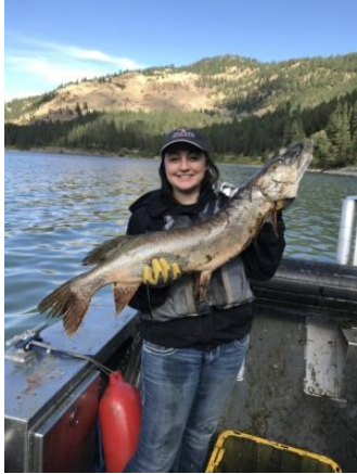
Lake Roosevelt Northern Pike Suppression and Monitoring Project

Upper Columbia United Tribes (UCUT) - The UCUT is comprised of the Coeur d'Alene Tribe, Confederated Tribes of the Colville Reservation, Kalispel Indian Community of the Kalispel Reservation, Kootenai Tribe of Idaho, and the Spokane Tribe of the Spokane Reservation. The UCUT continues its mission to serve its member Tribes' needs and interests by coordinating and uniting fish and wildlife mitigation and restoration work, and developing and participating in efficient local, regional, national, and international partnerships and cooperative relationships that result in direct on-the-ground implementation of efficient and cost-effective projects. The UCUT perform essential government functions to facilitate Federal trust responsibilities concerning the use, protection, and restoration of public resources, with significant benefits provided to regional economies across the Northwest.