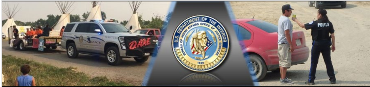
Police vehicle in a procession (left), IA Office of Justice Services seal (center), and an officer and civilian in a traffic stop (right).

sale, or distribution of illegal drugs. In addition to investigating crimes, OJS provides oversight and technical assistance to Tribal law enforcement agencies.