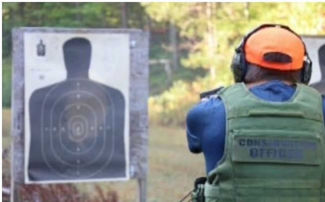
Conservation Law Enforcement officer training provided by NAFWS

Native American Fish & Wildlife Society - For more than 35 years, the Native American Fish & Wildlife Society (NAFWS), a non-profit, has addressed needs of its 227 member Tribes directly, through conferences, training, and youth education; and indirectly through ongoing support of, and providing venues for government consultations, discussions, and by participating with innovative projects and initiatives in Indian Country. Through its years of assisting Tribal efforts to build capacity and services, the NAFWS enriches Tribes through its mission: assisting Native American and Alaska Native Tribes with conserving, protecting, and enhancing their fish, wildlife, habitat, and cultural resources.