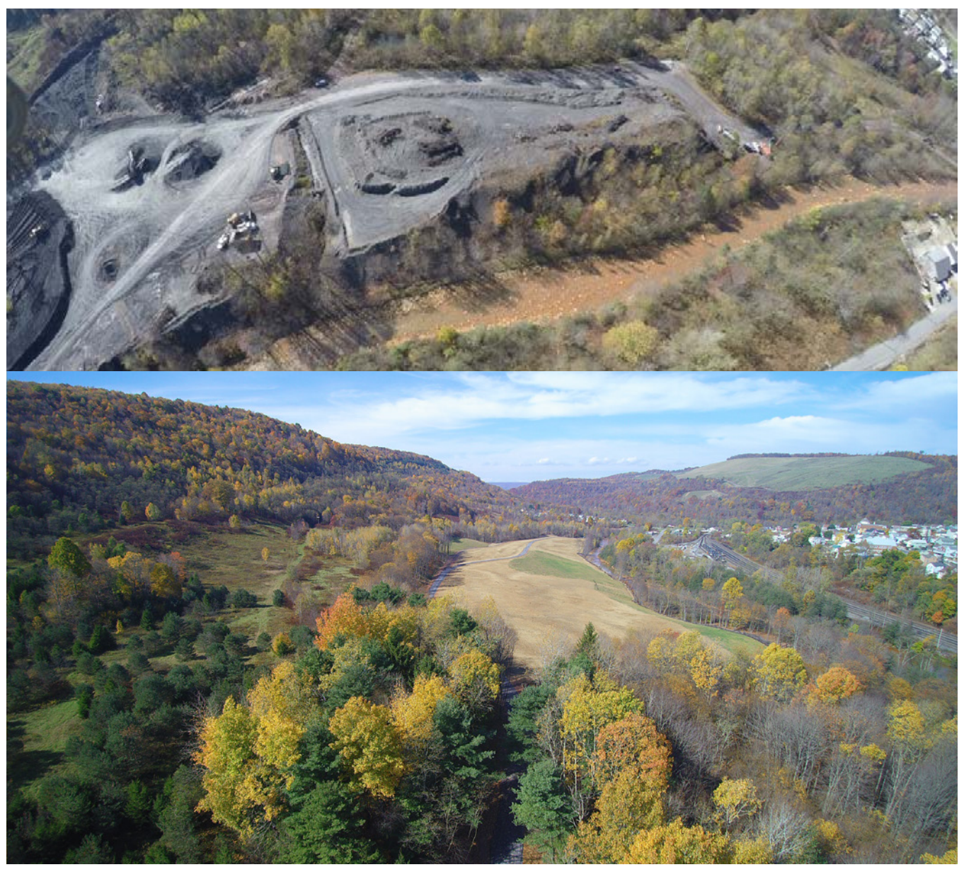
Stineman Refuse Pile.

Restored surface coal mining refuse site near South Fork, Pennsylvania. Following removal of 600,000 cubic yards of mining waste that was eroding into an adjacent river, the residents of South Fork along with visitors will be able to enjoy the reclaimed area's walking trails.