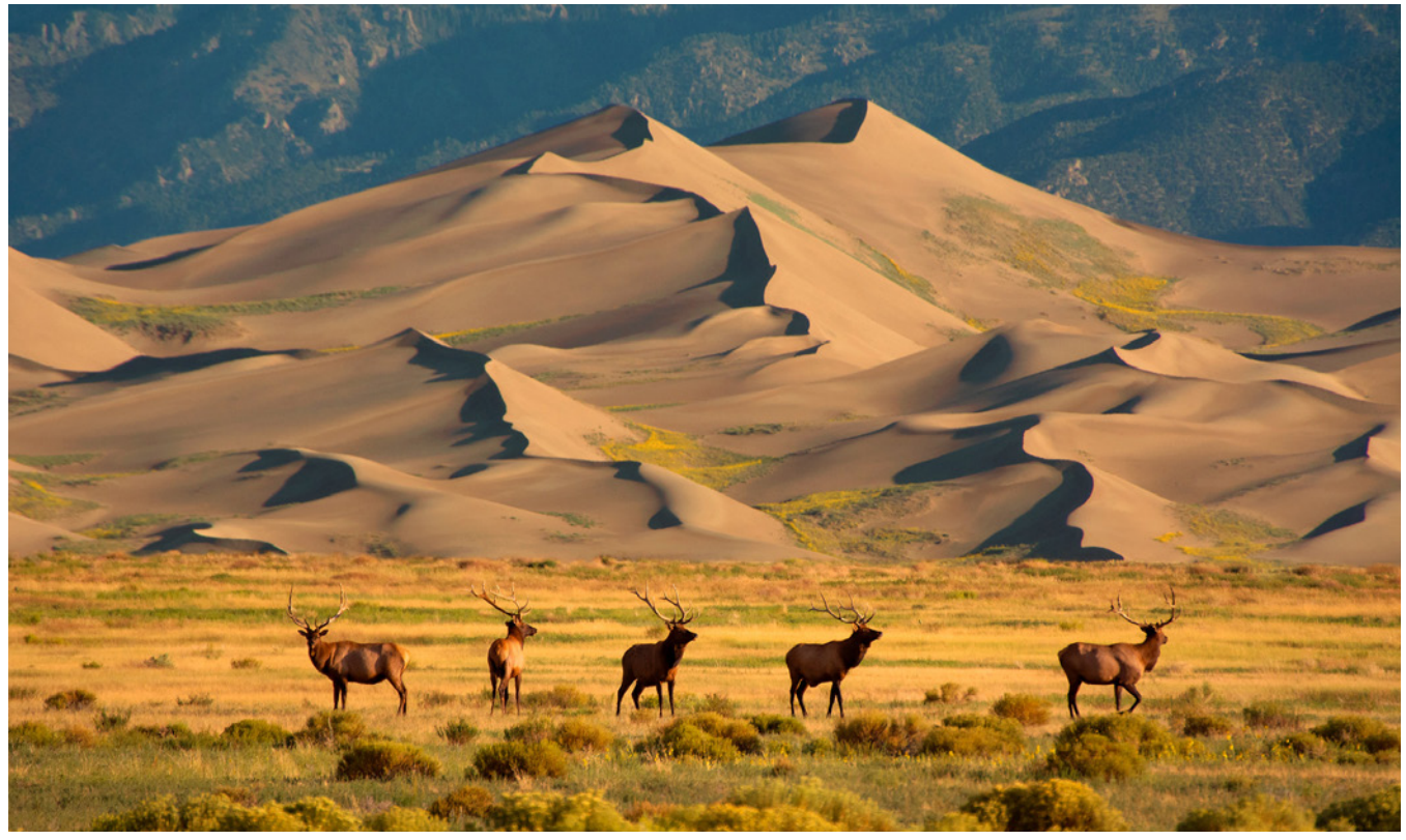
Great Sand Dunes National Park & Preserve in Colorado.