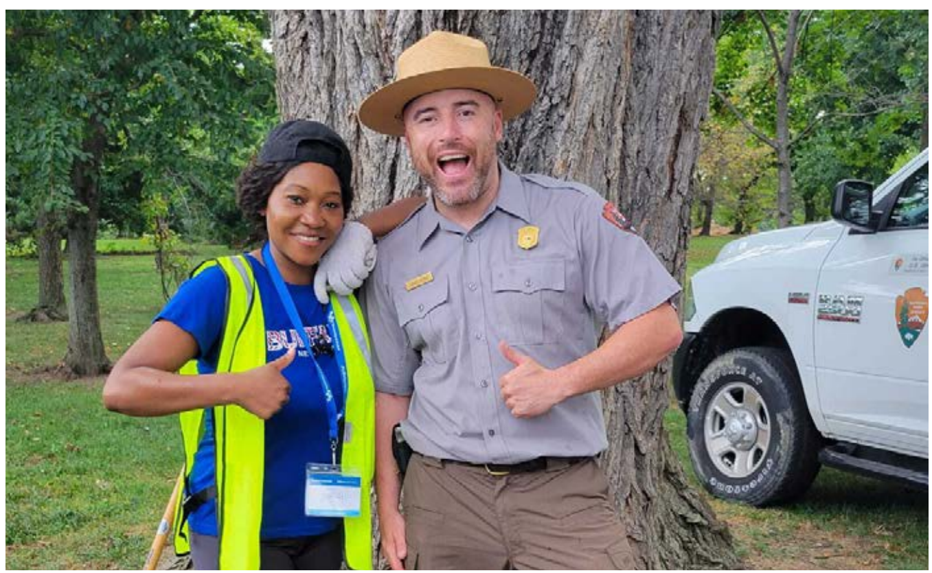
A University of Buffalo alumni volunteer with a Park Ranger after a volunteer event.

Science —Interior provides unbiased, multidisciplinary science for use in understanding, mapping, and managing natural resources and hazards. Data are available to the public from more than 11,000 streamgages and more than 3,300 earthquake sensors. Interior is also responsible for operating three Earth observation satellites—the Landsat 7, 8, and 9 missions. The United States Geological Survey (USGS) has provided Landsat data products from its archives at no cost since 2008. In 2021, USGS distributed more than 685 million remotely sensed data products, of which more than 669 million were Landsat data products.