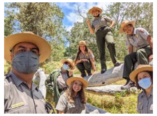
2021 Interpretation Youth Rangers at Kilauea's summit with mentor at Hawaii Volcanoes National Park.

The National Park Service (NPS) Hawaiian Youth Ranger Program connects socially and economically disadvantaged high school youth with Pathways Program opportunities at the Hawaiian national parks. The targeted audience for this program is Native Hawaiians. Many of the DOI and the NPS goals, such as a commitment to public service and furthering the understanding and appreciation of our Nation's natural and cultural resources, are advanced through the Youth Ranger Internship Program. The program also supports the Administration's efforts to advance equity and racial justice and support underserved communities. Five former Youth Rangers are in permanent positions at Hawai'i Volcanoes National Park, and five others are moving toward their NPS careers in ongoing college Pathways positions.