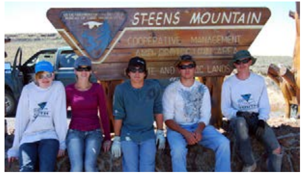
Members of the Oregon Youth Conservation Corps at Steens Mountain, OR.

To develop the next generation of lifelong conservation stewards and ensure its own skilled and diverse workforce pipeline, BLM Oregon-Washington has partnered with the Oregon Youth Conservation Corps (OYCC) to provide hundreds of work and training opportunities to young people across the State. The Oregon Legislature established the OYCC in 1987 to emulate the Civilian Conservation Corps of the 1930s and to provide a program to increase education, training, and employment opportunities for Oregon youth. The OYCC provides grants to local Youth Corps providers to run youth programs across the State serving individuals ages 13 to 24. These Youth Corps providers also serve as a valuable resource for developing programs; providing technical assistance; networking with other youth programs; and facilitating assistance in developing educational, service, and work projects with organizations such as BLM.