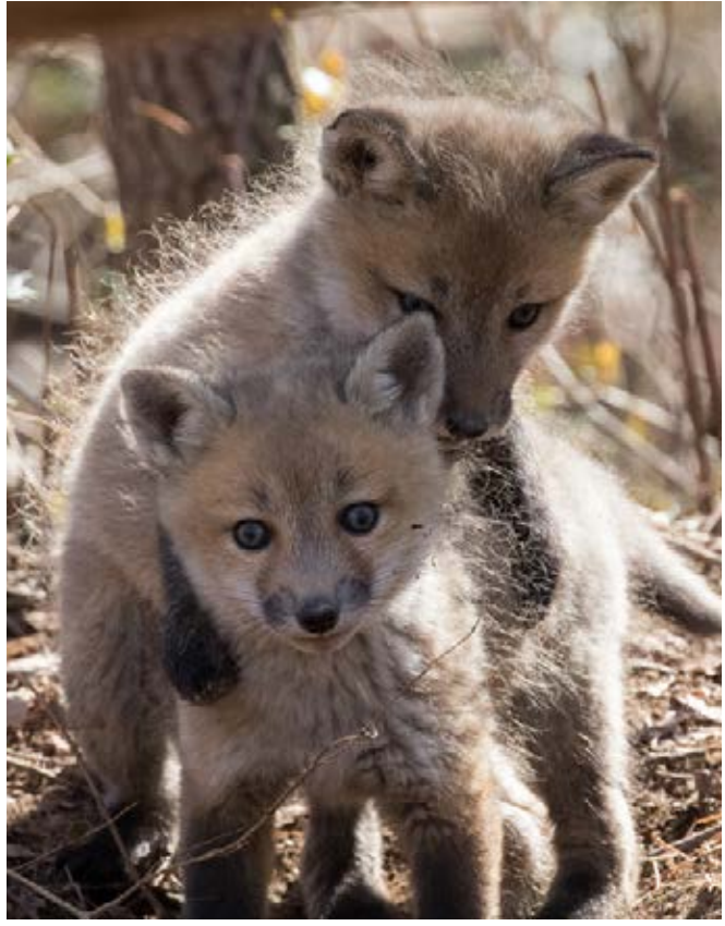
Red kit foxes in Bombay Hook National Wildlife Refuge in Delaware.

The 2023 budget proposes to allocate $681.9 million for Interior's LWCF programs. This funding includes $294.8 million for Interior land acquisition and $387.0 million for grant programs. Interior's land acquisition programs prioritize projects with strong local partnership engagement, protect at-risk natural or cultural resources, and