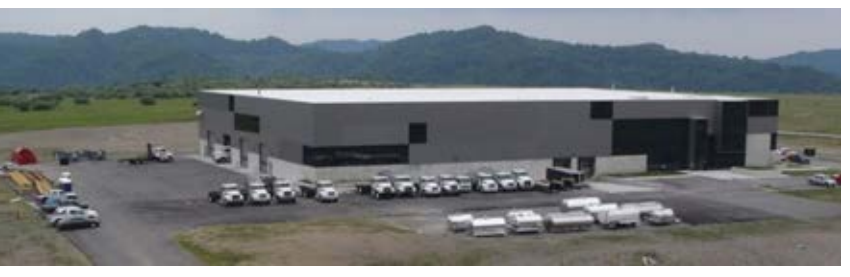
Marions Branch Industrial Park in Pike County, KY.

economy and long-term stability of the community. Project developers expect to attract more than 1,000 additional good-paying jobs to the area and stabilize the tax base of local communities.