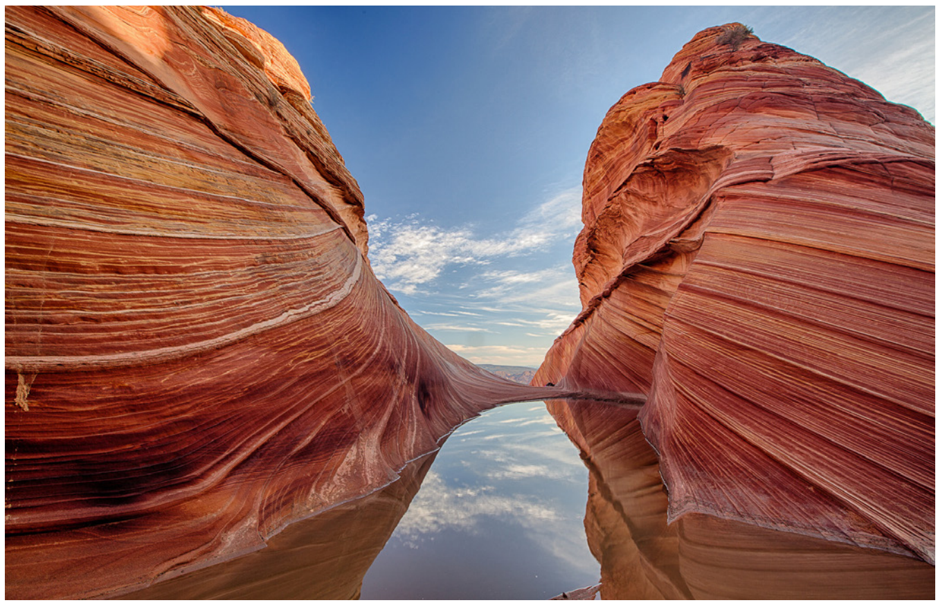
Vermillion Cliffs National Monument in Arizona.