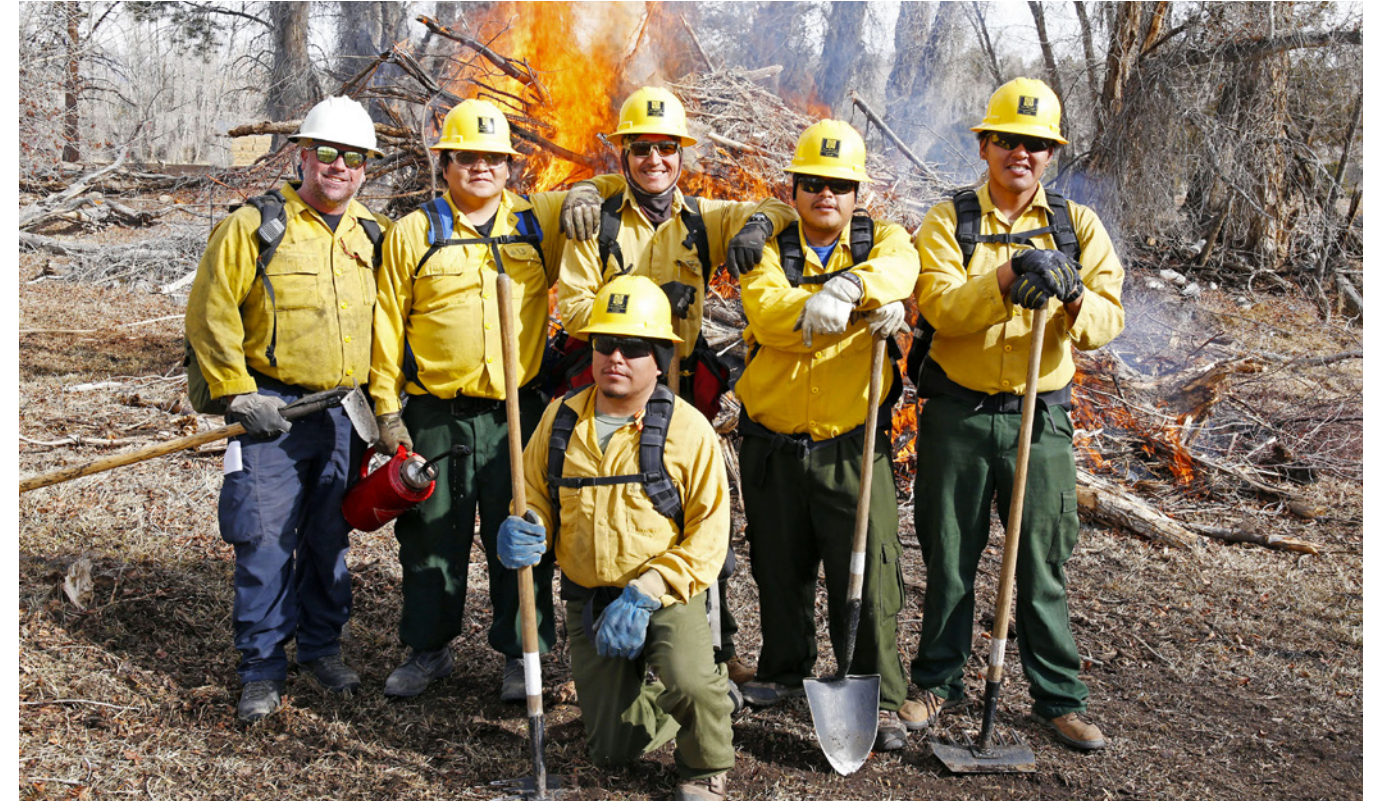
NPS funds an Ancestral Lands Veteran Fire Corps that employs and trains veterans in wildland firefighting operations.

The 2023 budget request for the Wildland Fire Management (WFM) account is $1.5 billion, including $340.0 million in wildfire suppression resources in the Wildfire Suppression Operations Reserve Fund, which was authorized by the Consolidated Appropriations Act, 2018 (Public Law 115-141). The Reserve Fund ensures the availability of sufficient funds above the appropriated amount for suppression in the event of a severe fire season. The budget includes $477.2 million for Preparedness. This budget request will provide resources for Interior to increase firefighting capacity, continue