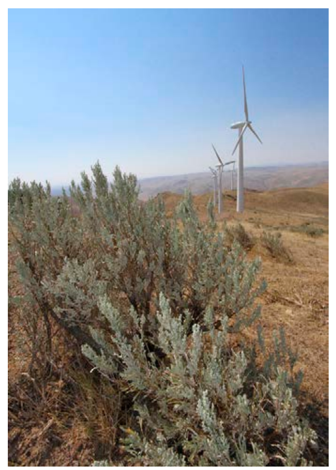
Lime Wind Energy Project in Oregon

Onshore, the Administration's clean energy goal is to permit 25 GW of renewable energy by 2025, as required by the Energy Act of 2020. Interior plays a central role in achieving this goal by carrying out environmental reviews for clean energy projects on our Nation's public lands, conducting meaningful consultations with Tribal Nations, and assessing potential impacts to species. To help achieve this