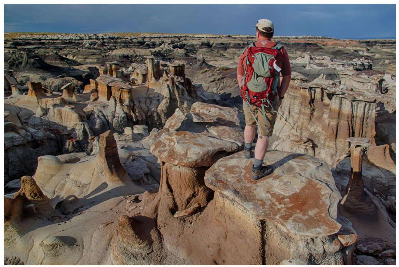
Hiking Bisti De-Na-Zin Wilderness in New Mexico.

Interior is also investing in cybersecurity to ensure that the security and integrity of our systems are not compromised. In January 2022, the Cybersecurity and Infrastructure Security Agency, FBI, and National Security Agency encouraged all agencies to increase cyber resilience in light of elevated risk. Interior continues to pivot to keep pace with a dynamic cybersecurity environment and deploy needed mitigation tools and upgraded capabilities. The 2023 budget includes $44.3 million to address high-priority cyber defense requirements, better detect emerging threats, make needed improvements to Interior's IT networks, initiate supply chain risk management analysis, and maintain ongoing operations.