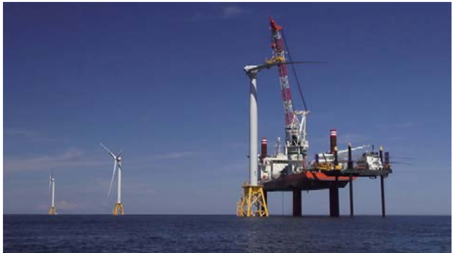
Installation activities at the Block Island Wind Farm, RI.

In response to direction in Executive Order 14008—Tackling the Climate Crisis at Home and Abroad—and in light of the Secretary of the Interior's broad stewardship responsibilities, the Department conducted a review of its oil and gas program and published a report of its findings in November 2021. The report identifies key reforms necessary to ensure that the programs provide a fair return to taxpayers, discourage speculation, reduce environmental impacts, hold operators responsible for remediation, and create a more inclusive and just approach to managing public lands and waters. The Department's report makes a number of specific recommendations to restore balance to these programs, including adjusting royalty rates, pursuing adequate financial assurance for decommissioning liabilities, and prioritizing leasing in areas with