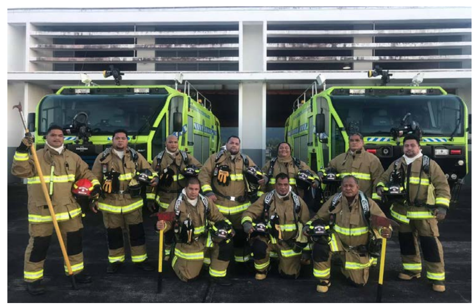
OIA funded a grant for the American Samoa Airport Rescue and Fire Fighters' self-contained breathing apparatus and personal protective equipment.