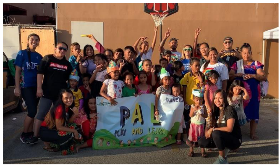
OIA grantee Mañe'lu runs the Micronesian Resource Center One-Stop Shop in Guam. Pictured is one of their Play and Learn (PAL) sessions in collaboration with the Guam Department of Public Health and Social Services' Kariñu Project. The PAL sessions focus on encouraging parent and child play, and giving parents the skills and knowledge to interact with their children using everyday household items and a little creativity.

includes $7.8 million for Federal Services (including $5.0 million for Marshall Islands Tax and Trade Compensation) and $650,000 for Enewetak.