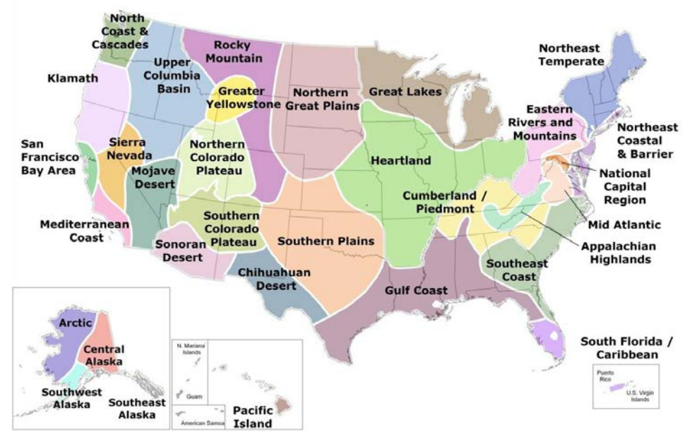
NPS conducts systematic inventories of natural resources and monitoring of park resource conditions through the organization of 32 ecosystem-based multi-park Inventory and Monitoring Networks.

Climate Science—The 2022 budget reflects the President's priority to ensure that objective science underpins the Administration's actions to tackle the climate change crisis. Science will be vital to identify problems, develop solutions, measure progress, and achieve results. The 2022 NPS budget includes an increase of $10.0 million for Climate Science activities to identify changes in and stressors to park resources. This increase is complemented by other increases that speed implementation of climate science findings to apply them to natural resources challenges. NPS administers a park systemwide inventory and monitoring effort designed to address natural resource needs. The program conducts basic natural resource inventories and monitors the condition or health of key vital sign parameters. This science-based information helps provide park managers, planners, and interpreters with a broad-based understanding of