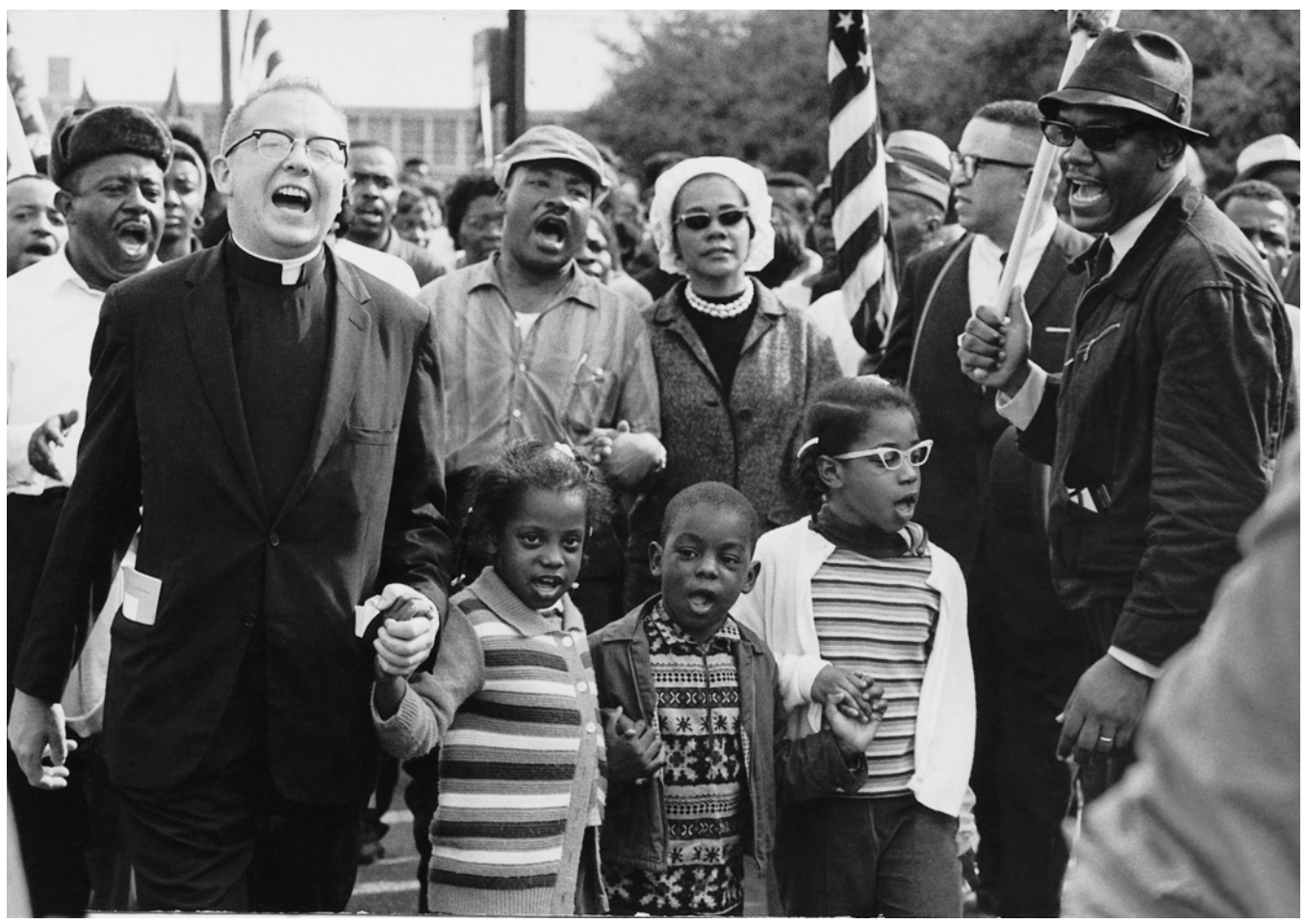
The 54-mile Selma to Montgomery National Historic Trail commemorates several notable events in the history of African American Civil Rights activism in America including the pivotal 1965 Voting Rights March in Alabama.

changes are discussed in the Conservation and Racial Equity sections of the chapter.