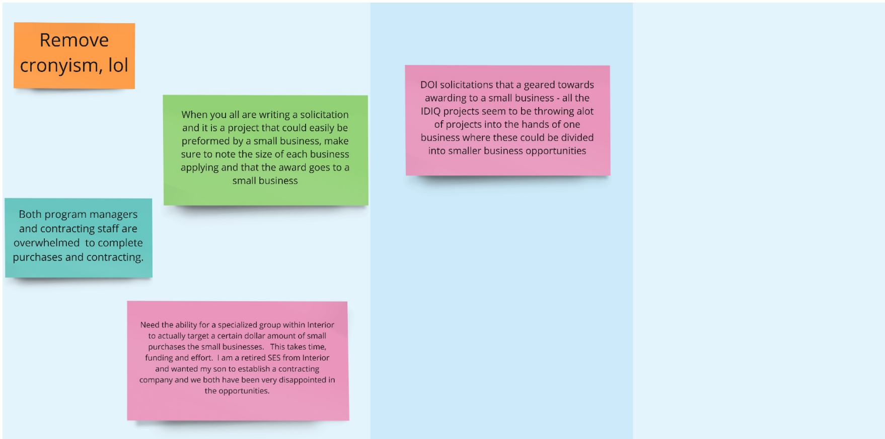
Figure 4: Recommendations Miro Board Screenshot