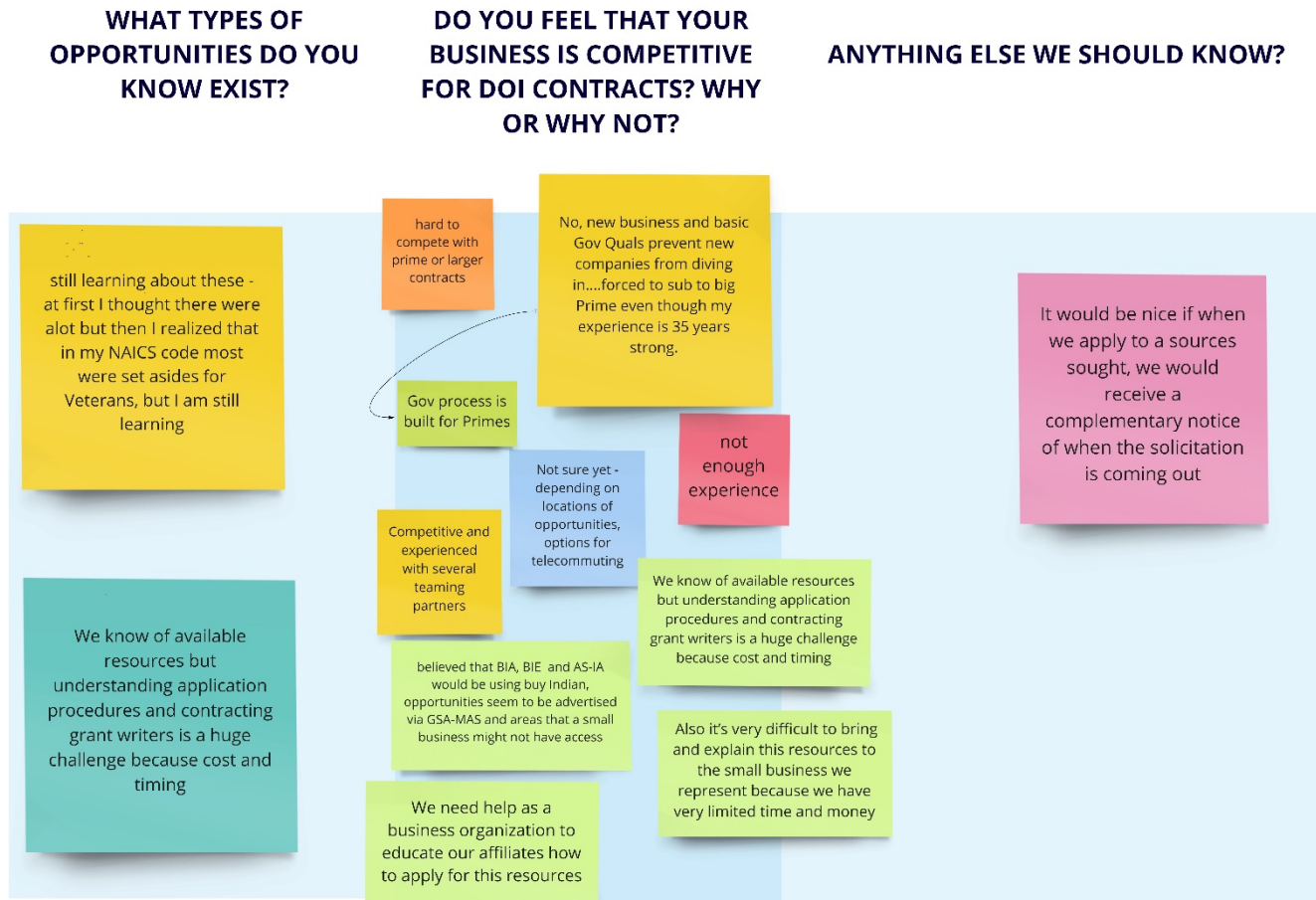
Figure 1: Perceptions Miro Board Screenshot

This Appendix features participant responses to the DOI Listening Session on Contracts for Businesses with Characteristics that Align with the Definition of Underserved Community on October 21, 2021, from 5:00 pm - 7:00 pm ET. The sticky notes included on the board reflect participants' own words, experiences, reflections, and recommendations.