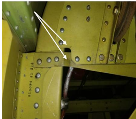
Figure 1. Cracks in aircraft bulkhead.

The contractor has submitted a Service Difficulty Report (SDR) as required by 14CFR part 135. They are also working with the manufacturer and a Designated Engineering Representative (DER) to determine an appropriate repair of the affected aircraft.